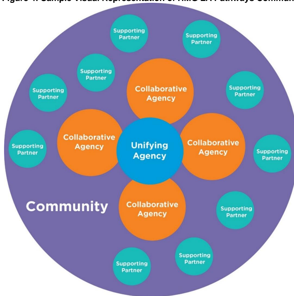
Figure 4: Sample Visual Representation of HMG LA Pathways Community Structure

It is expected that the Unifying Agencies are a part of the above EII continuum, have a community-level presence in the catchment area that they are applying to and a deep understanding of that community's EII landscape. The Unifying Agency may be a: health, mental health, child welfare, or early childhood education program, Regional Center, school district, or similar agency. This collaborative structure will position the HMG LA Pathways communities to enhance their relationships, skills and capacities to strengthen and expand EII referral pathways.