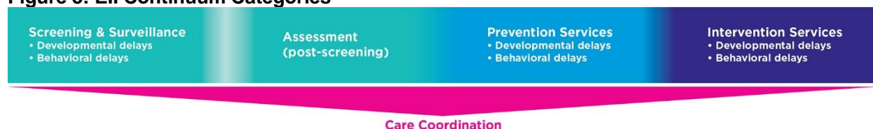
Figure 3: EII Continuum Categories 13

First 5 LA has allocated funding for seven (7) HMG LA Pathways communities across the county to strengthen referral pathways between service sectors. First 5 LA organized these areas to align with the Regional Center catchment areas (see Appendix A ). Note that this RFP is the second RFP for this project. An earlier RFP (Wave 1) released on September 25, 2019 resulted in the selection of Unifying Agencies for five of the seven communities whose contracts began October 1, 2020. 14 This RFP (Wave 2) is seeking proposals from organizations interested in serving as the Unifying Agency for Communities 2 (San Gabriel/Pomona) and 7 (Harbor).